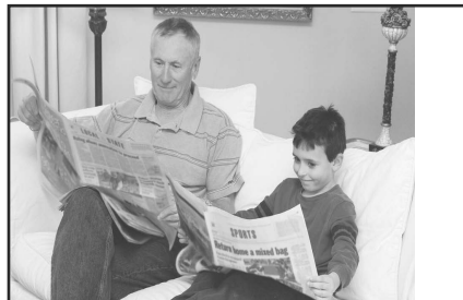
I Saw Your Ad In The Fairfield Bay News!